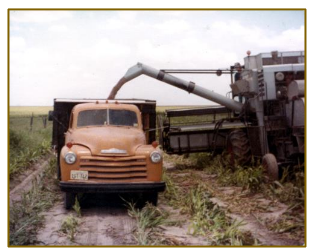
Lyssy Farm, McCook, Texas